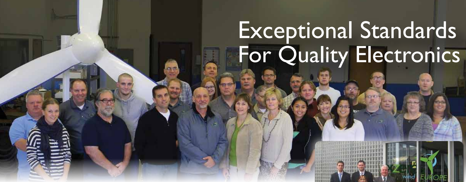
Wilsonville, OR USA

XZERES Corporation engineers, manufactures and distributes wind energy and power efficiency solutions. Publicly traded and funded, XZERES is dedicated to providing security against tomorrow's higher priced energy economy with intelligent power production and use of energy.